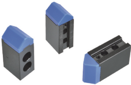
▶ 尖型軟質油壓生爪 Pointed Type